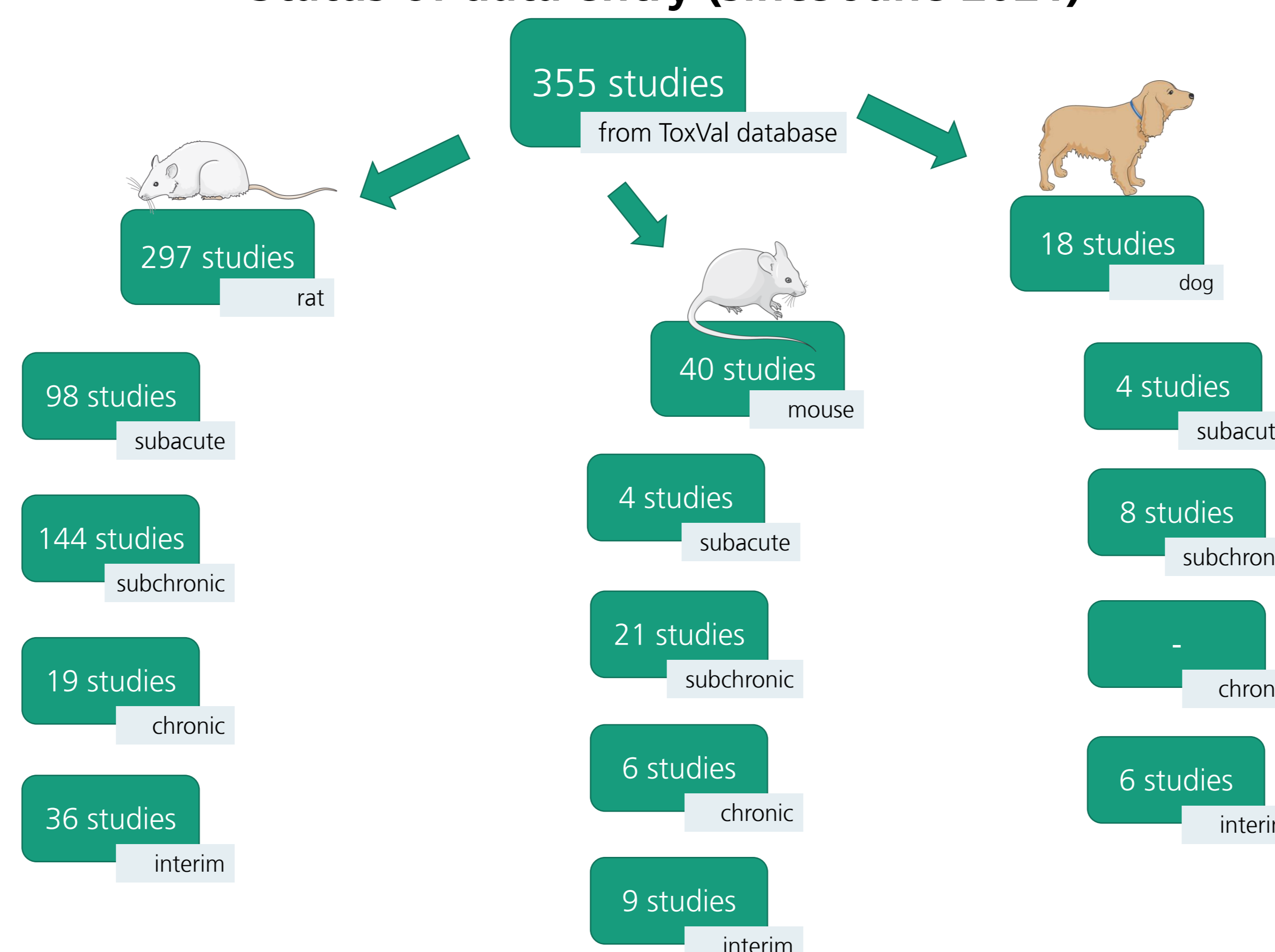
Figure 3: Distribution of the studies entered so far stratified to examined animals and study duration a